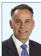
John Pesutto MP Victorian Liberal Leader